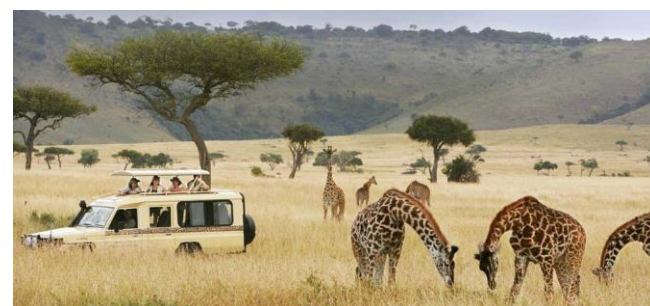
With parks like the Nakuru National Park and the Maasai Mara as well as perfect beaches and stunning mountains, Kenya offers a rich natural and cultural experience.