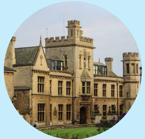
Oundle School, Peterborough