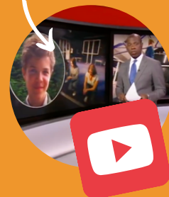
Students from Harrow schools performing Game Over

See the BBC News report on Game Over's premiere at Beaumont School in 2019.